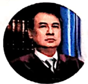
CHIEF JUSTICE ALEXANDER G. GESMUNDO Supreme Court Keynote Speaker