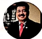
CHAIR J. PROSPERO E. DE VERA III Chairperson Commission on Higher Education